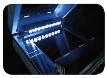
Built-in blue LED module provides flexibility in DNA stain selection