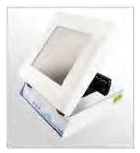
UV light applied