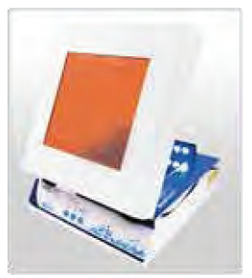
Blue light applied