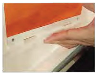
Removable amber Filter